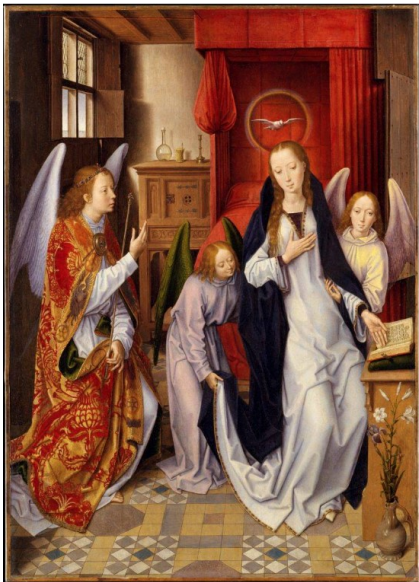
The Annunciation, Hans Memling (15th C.)

Then Mary said, "Here am I, the servant of the Lord; let it be with me according to your word."