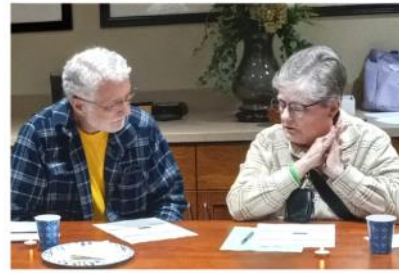
Members of the Justice Ministry at Grace gather to discuss issues of community importance.