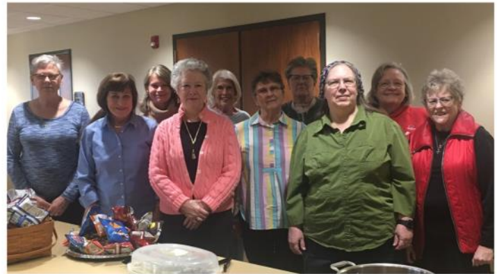
Members of the Daughters of the King provided one of our Wednesday Lenten suppers.