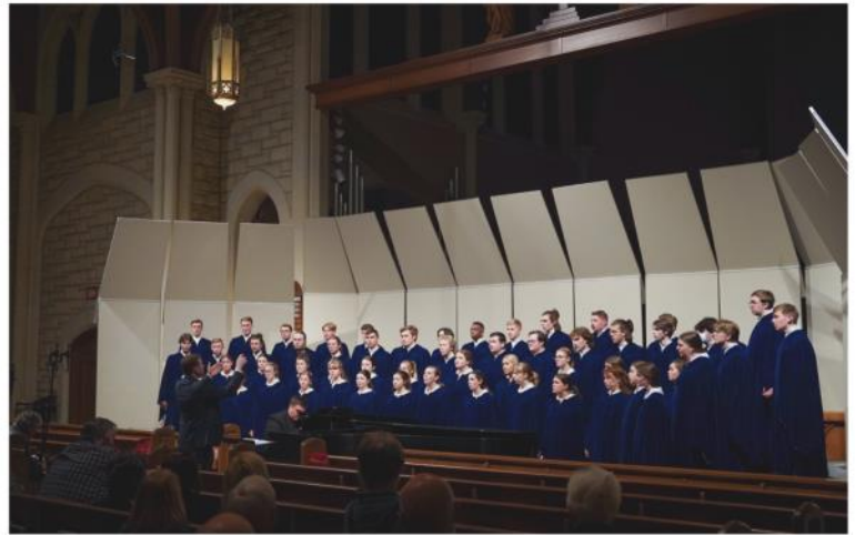
GREAT SPACES Music and Arts Series hosts the Concordia Choir from Moorhead Minnesota.