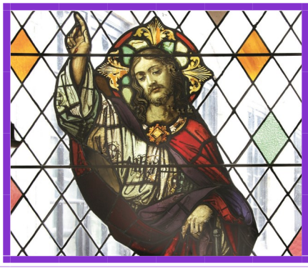
Christ the King Sunday, Nov. 20