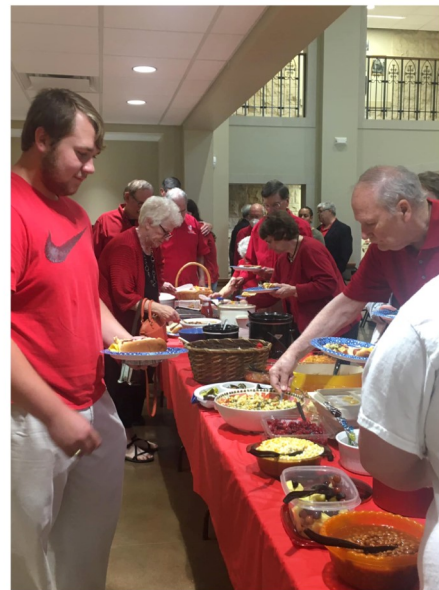
Our annual Pentecost Picnic was held on June 5.