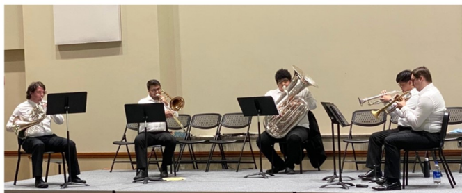
The Sunflower Music Festival sponsored a lunchtime concert at the Cathedral on June 22. Attendees enjoyed a sack lunch and music by the Blanche Bryden Collegiate Brass Quintet.