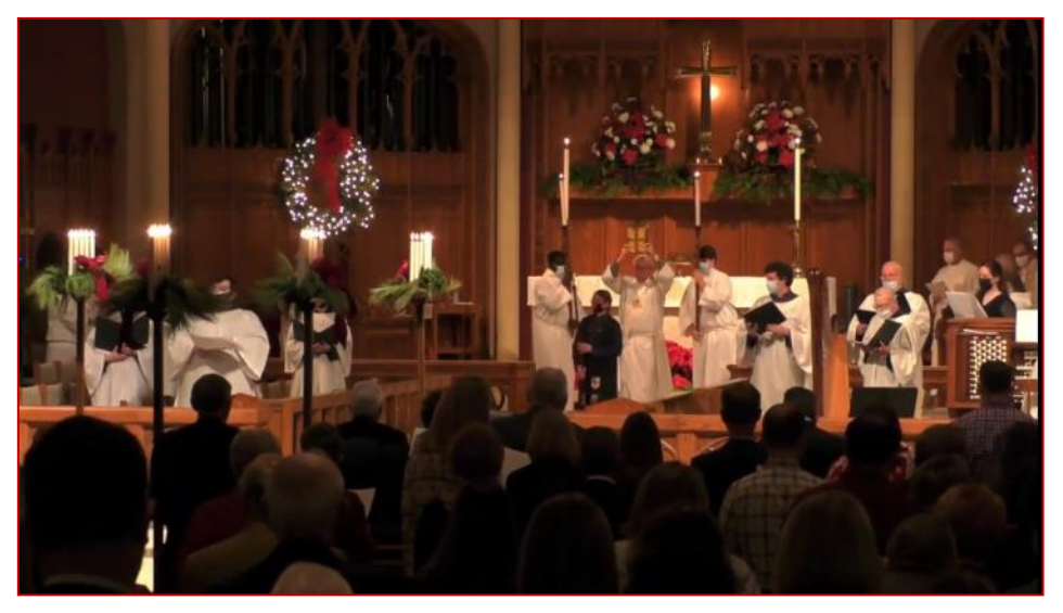
Christmas Eve at Grace Cathedral