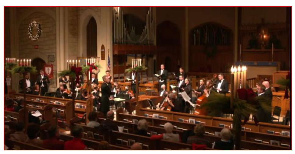
Spire Ensemble & Orchestra present The Messiah